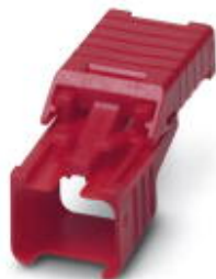
Lockable security element

Please be informed that the data shown in this PDF Document is generated from our Online Catalog. Please find the complete data in the user's documentation. Our General Terms of Use for Downloads are valid ( http://phoenixcontact.com/download )