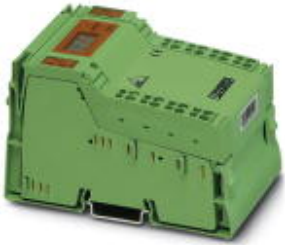
AS-i Gateway for Inline, IP20 protection, color: Green

Please be informed that the data shown in this PDF Document is generated from our Online Catalog. Please find the complete data in the user's documentation. Our General Terms of Use for Downloads are valid ( http://phoenixcontact.com/download )