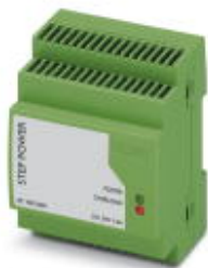
DIN rail power supply unit 24 V DC/1.5 A, primary-switched mode, low-profile design

Please be informed that the data shown in this PDF Document is generated from our Online Catalog. Please find the complete data in the user's documentation. Our General Terms of Use for Downloads are valid ( http://phoenixcontact.com/download )