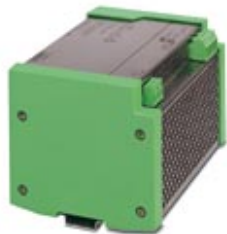
Power supply unit, primary switched-mode, input 230 V AC, output 24 V DC/10 A, with filter

Please be informed that the data shown in this PDF Document is generated from our Online Catalog. Please find the complete data in the user's documentation. Our General Terms of Use for Downloads are valid ( http://phoenixcontact.com/download )