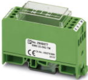
Diode module, with 7 diodes, common anode, diode type 1N 4007

Please be informed that the data shown in this PDF Document is generated from our Online Catalog. Please find the complete data in the user's documentation. Our General Terms of Use for Downloads are valid ( http://phoenixcontact.com/download )