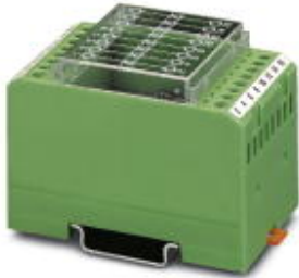
Diode module, with 8 diodes, individually wired, diode type 1N 4007

Please be informed that the data shown in this PDF Document is generated from our Online Catalog. Please find the complete data in the user's documentation. Our General Terms of Use for Downloads are valid ( http://phoenixcontact.com/download )