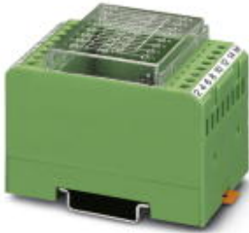
Lamp test module, 2 diodes with common cathode: with 7 pairs, with common triggering

Please be informed that the data shown in this PDF Document is generated from our Online Catalog. Please find the complete data in the user's documentation. Our General Terms of Use for Downloads are valid ( http://phoenixcontact.com/download )