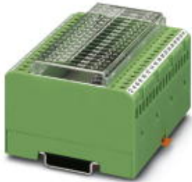
Lamp test module, 2 diodes with common cathode: with 16 pairs, with common triggering

Please be informed that the data shown in this PDF Document is generated from our Online Catalog. Please find the complete data in the user's documentation. Our General Terms of Use for Downloads are valid ( http://phoenixcontact.com/download )