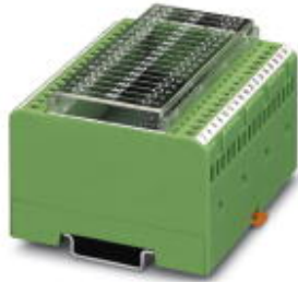
Diode module, with 17 diodes, individually wired, diode type 1N 4007

Please be informed that the data shown in this PDF Document is generated from our Online Catalog. Please find the complete data in the user's documentation. Our General Terms of Use for Downloads are valid ( http://phoenixcontact.com/download )