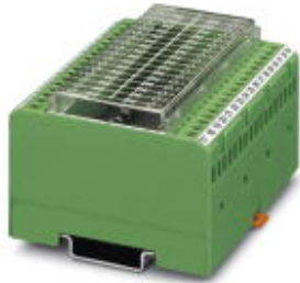
Diode module, with 32 diodes, common anode, diode type 1N 4007

Please be informed that the data shown in this PDF Document is generated from our Online Catalog. Please find the complete data in the user's documentation. Our General Terms of Use for Downloads are valid ( http://phoenixcontact.com/download )