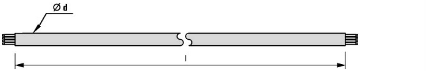
SWD round cable, 8 pole