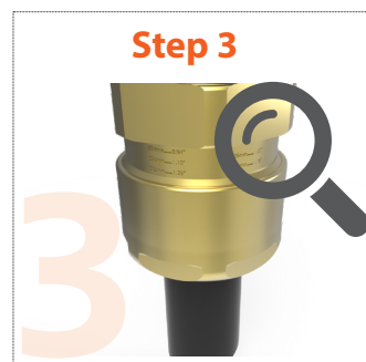
The backnut should be level with the marking guide corresponding to its diameter – this can be visually inspected and adjusted as necessary

Note: The cable gland installation instructions have a printed cable OD measure for if the cable OD is not known