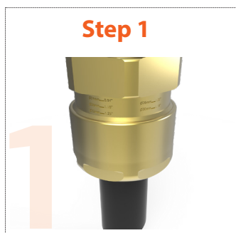
Follow cable gland installation instructions until final stage – tightening of rear seal

The gland is permanently marked with various lines/numbers indicating the correct tightening level related to the cable diameter. Following the relevant cable gland Installation Instructions, the back seal should be tightened until a seal is formed on the cable outer sheath and then tightened one further turn.