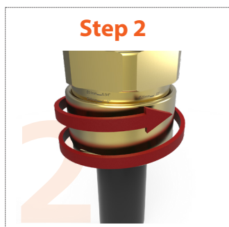
Tighten backnut until a seal is formed onto the cable, then tighten one further turn