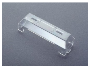
79448 grip lug cover for NH base and 33705 NH 00