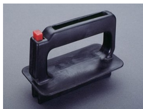
03502 NH fuse extractor handle without sleeve size 000 - 3