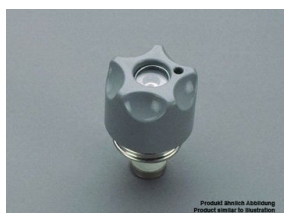
31104 D02 screw cap, plastic, with reducer for D01 400 V, with inspection hole E 18