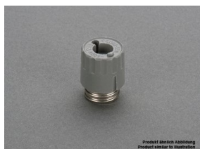
31006 D02 screw cap, plastic 400 V E 18