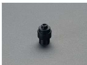
31904 locking cap D02 version "utility" 400 V E 18