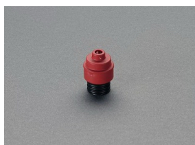
31910 locking cap D02 version "industry" 400 V E 18