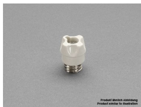
01104 D02 screw cap, porcelain 400 V E 18