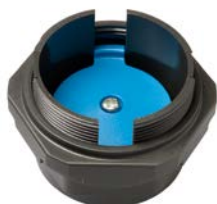
Photo: Inside view