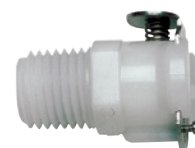
Typical shown: 1/4" NPT Male Pipe Thread with Shut-off Valve

These adapters are available with or without an integral shut-off valve. The shut-off valve will stop line flow when the adapter is removed from the unit. Flow resumes when connected.