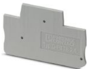
End cover, length: 68 mm, width: 2.2 mm, height: 39.6 mm, color: gray

Please be informed that the data shown in this PDF Document is generated from our Online Catalog. Please find the complete data in the user's documentation. Our General Terms of Use for Downloads are valid ( http://phoenixcontact.com/download )