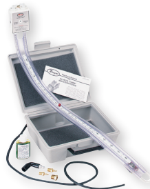
1212 gas pressure kit