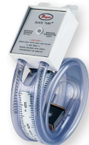
Slack Tube® manometer rolled up for easy handling and storage