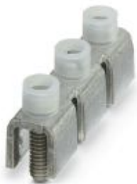
Fixed bridge, pitch: 20 mm, number of positions: 3, color: silver

Please be informed that the data shown in this PDF Document is generated from our Online Catalog. Please find the complete data in the user's documentation. Our General Terms of Use for Downloads are valid ( http://phoenixcontact.com/download )