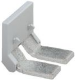
Insertion bridge, pitch: 31 mm, number of positions: 2, color: gray

Please be informed that the data shown in this PDF Document is generated from our Online Catalog. Please find the complete data in the user's documentation. Our General Terms of Use for Downloads are valid ( http://phoenixcontact.com/download )