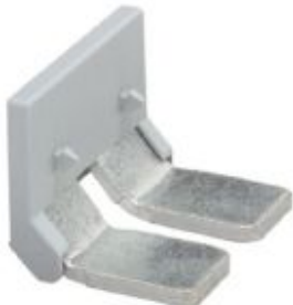
Insertion bridge, pitch: 36 mm, number of positions: 2, color: gray

Please be informed that the data shown in this PDF Document is generated from our Online Catalog. Please find the complete data in the user's documentation. Our General Terms of Use for Downloads are valid ( http://phoenixcontact.com/download )