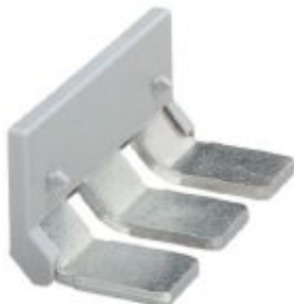
Insertion bridge, pitch: 36 mm, number of positions: 3, color: gray

Please be informed that the data shown in this PDF Document is generated from our Online Catalog. Please find the complete data in the user's documentation. Our General Terms of Use for Downloads are valid ( http://phoenixcontact.com/download )