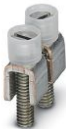
Fixed bridge, pitch: 10 mm, number of positions: 2, color: silver

Please be informed that the data shown in this PDF Document is generated from our Online Catalog. Please find the complete data in the user's documentation. Our General Terms of Use for Downloads are valid ( http://phoenixcontact.com/download )