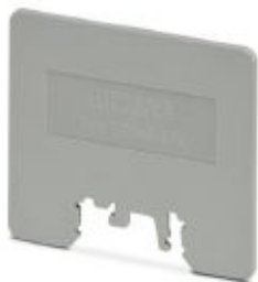
Partition plate, length: 80 mm, width: 2 mm, height: 70 mm, color: gray

Please be informed that the data shown in this PDF Document is generated from our Online Catalog. Please find the complete data in the user's documentation. Our General Terms of Use for Downloads are valid ( http://phoenixcontact.com/download )