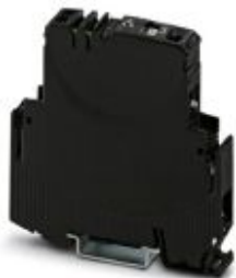
Electronic circuit breaker, 1 reset input, nominal current: 6 A

Please be informed that the data shown in this PDF Document is generated from our Online Catalog. Please find the complete data in the user's documentation. Our General Terms of Use for Downloads are valid ( http://phoenixcontact.com/download )