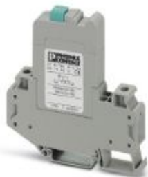
Thermomagnetic circuit breaker, 1-pos., for DIN rail mounting

Please be informed that the data shown in this PDF Document is generated from our Online Catalog. Please find the complete data in the user's documentation. Our General Terms of Use for Downloads are valid ( http://phoenixcontact.com/download )