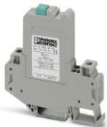
Thermomagnetic circuit breaker, 1-pos., for DIN rail mounting

Please be informed that the data shown in this PDF Document is generated from our Online Catalog. Please find the complete data in the user's documentation. Our General Terms of Use for Downloads are valid ( http://phoenixcontact.com/download )