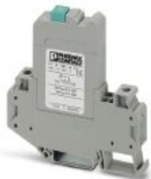
Thermomagnetic circuit breaker, 1-pos., for DIN rail mounting

Please be informed that the data shown in this PDF Document is generated from our Online Catalog. Please find the complete data in the user's documentation. Our General Terms of Use for Downloads are valid ( http://phoenixcontact.com/download )