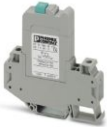
Thermomagnetic circuit breaker, 1-pos., for DIN rail mounting

Please be informed that the data shown in this PDF Document is generated from our Online Catalog. Please find the complete data in the user's documentation. Our General Terms of Use for Downloads are valid ( http://phoenixcontact.com/download )