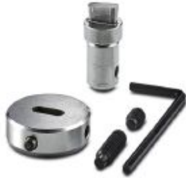
Stamping bit, for elongated holes: 4.5 x 12 mm

Please be informed that the data shown in this PDF Document is generated from our Online Catalog. Please find the complete data in the user's documentation. Our General Terms of Use for Downloads are valid ( http://phoenixcontact.com/download )