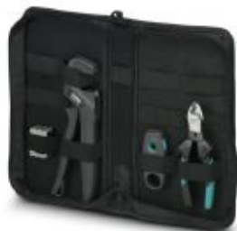
Tool set, equipped

Please be informed that the data shown in this PDF Document is generated from our Online Catalog. Please find the complete data in the user's documentation. Our General Terms of Use for Downloads are valid ( http://phoenixcontact.com/download )