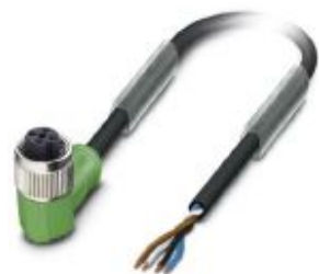
Sensor/actuator cable, 4-position, PVC, black RAL 9005, free cable end, on Socket angled M12, coding: A, cable length: 10 m

Please be informed that the data shown in this PDF Document is generated from our Online Catalog. Please find the complete data in the user's documentation. Our General Terms of Use for Downloads are valid ( http://phoenixcontact.com/download )