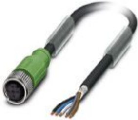
Sensor/actuator cable, 5-position, PUR halogen-free, black-gray RAL 7021, shielded, free cable end, on Socket straight M12, coding: A, cable length: 10 m

Please be informed that the data shown in this PDF Document is generated from our Online Catalog. Please find the complete data in the user's documentation. Our General Terms of Use for Downloads are valid ( http://phoenixcontact.com/download )