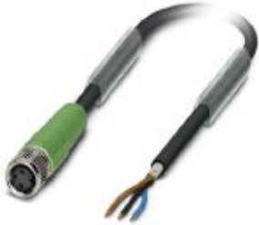
Sensor/actuator cable, 3-position, PUR halogen-free, black-gray RAL 7021, shielded, free cable end, on Socket straight M8, cable length: 5 m

Please be informed that the data shown in this PDF Document is generated from our Online Catalog. Please find the complete data in the user's documentation. Our General Terms of Use for Downloads are valid ( http://phoenixcontact.com/download )