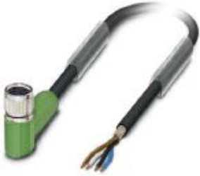
Sensor/actuator cable, 4-position, PUR halogen-free, black-gray RAL 7021, shielded, free cable end, on Socket angled M8, cable length: 10 m

Please be informed that the data shown in this PDF Document is generated from our Online Catalog. Please find the complete data in the user's documentation. Our General Terms of Use for Downloads are valid ( http://phoenixcontact.com/download )