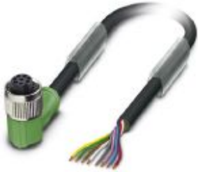
Sensor/actuator cable, 8-position, PUR halogen-free, black-gray RAL 7021, free cable end, on Socket angled M12, coding: A, cable length: 5 m

Please be informed that the data shown in this PDF Document is generated from our Online Catalog. Please find the complete data in the user's documentation. Our General Terms of Use for Downloads are valid ( http://phoenixcontact.com/download )