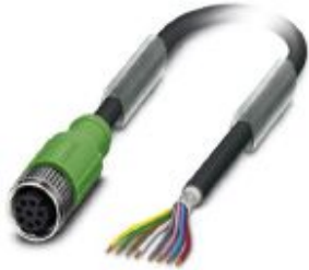
Sensor/actuator cable, 8-position, PUR halogen-free, black-gray RAL 7021, shielded, free cable end, on Socket straight M12, coding: A, cable length: 5 m

Please be informed that the data shown in this PDF Document is generated from our Online Catalog. Please find the complete data in the user's documentation. Our General Terms of Use for Downloads are valid ( http://phoenixcontact.com/download )