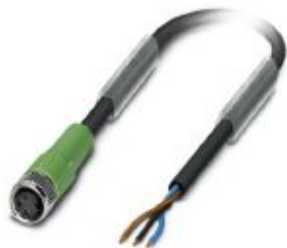
Sensor/actuator cable, 3-position, PUR halogen-free, black-gray RAL 7021, free cable end, on Socket straight M8, cable length: 5 m

Please be informed that the data shown in this PDF Document is generated from our Online Catalog. Please find the complete data in the user's documentation. Our General Terms of Use for Downloads are valid ( http://phoenixcontact.com/download )