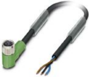
Sensor/actuator cable, 3-position, PUR halogen-free, black-gray RAL 7021, free cable end, on Socket angled M8, cable length: 5 m

Please be informed that the data shown in this PDF Document is generated from our Online Catalog. Please find the complete data in the user's documentation. Our General Terms of Use for Downloads are valid ( http://phoenixcontact.com/download )