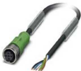
Sensor/actuator cable, 5-position, PUR halogen-free, black-gray RAL 7021, free cable end, on Socket straight M12, coding: A, cable length: 5 m

Please be informed that the data shown in this PDF Document is generated from our Online Catalog. Please find the complete data in the user's documentation. Our General Terms of Use for Downloads are valid ( http://phoenixcontact.com/download )