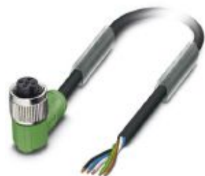
Sensor/actuator cable, 5-position, PUR halogen-free, black-gray RAL 7021, free cable end, on Socket angled M12, coding: A, cable length: 3 m

Please be informed that the data shown in this PDF Document is generated from our Online Catalog. Please find the complete data in the user's documentation. Our General Terms of Use for Downloads are valid ( http://phoenixcontact.com/download )