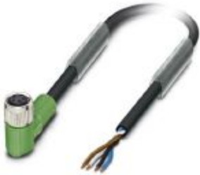
Sensor/actuator cable, 4-position, PUR halogen-free, black-gray RAL 7021, free cable end, on Socket angled M8, cable length: 5 m

Please be informed that the data shown in this PDF Document is generated from our Online Catalog. Please find the complete data in the user's documentation. Our General Terms of Use for Downloads are valid ( http://phoenixcontact.com/download )