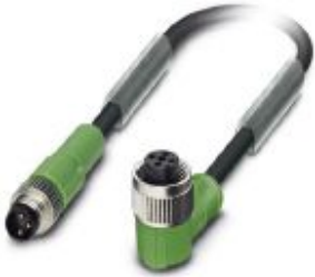
Sensor/actuator cable, 3-position, PUR halogen-free, black-gray RAL 7021, Plug straight M8, on Socket angled M12, coding: A, cable length: 1.5 m

Please be informed that the data shown in this PDF Document is generated from our Online Catalog. Please find the complete data in the user's documentation. Our General Terms of Use for Downloads are valid ( http://phoenixcontact.com/download )