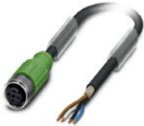
Sensor/actuator cable, 4-position, PUR halogen-free, black-gray RAL 7021, shielded, free cable end, on Socket straight M12, coding: A, cable length: 3 m

Please be informed that the data shown in this PDF Document is generated from our Online Catalog. Please find the complete data in the user's documentation. Our General Terms of Use for Downloads are valid ( http://phoenixcontact.com/download )