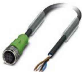
Sensor/actuator cable, 4-position, PUR halogen-free, black-gray RAL 7021, free cable end, on Socket straight M12, coding: A, cable length: 10 m

Please be informed that the data shown in this PDF Document is generated from our Online Catalog. Please find the complete data in the user's documentation. Our General Terms of Use for Downloads are valid ( http://phoenixcontact.com/download )