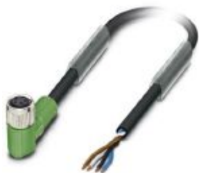
Sensor/actuator cable, 4-position, PUR halogen-free, black-gray RAL 7021, free cable end, on Socket angled M8, cable length: 10 m

Please be informed that the data shown in this PDF Document is generated from our Online Catalog. Please find the complete data in the user's documentation. Our General Terms of Use for Downloads are valid ( http://phoenixcontact.com/download )