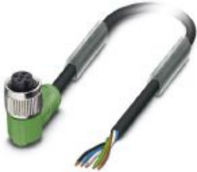
Sensor/actuator cable, 5-position, PUR halogen-free, black-gray RAL 7021, free cable end, on Socket angled M12, coding: A, cable length: 10 m

Please be informed that the data shown in this PDF Document is generated from our Online Catalog. Please find the complete data in the user's documentation. Our General Terms of Use for Downloads are valid ( http://phoenixcontact.com/download )