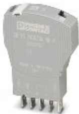
Electronic device circuit breaker, 1-pos., active current limitation, 1 N/O contact, plug for base element.

Please be informed that the data shown in this PDF Document is generated from our Online Catalog. Please find the complete data in the user's documentation. Our General Terms of Use for Downloads are valid ( http://phoenixcontact.com/download )