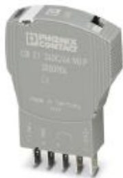
Electronic device circuit breaker, 1-pos., active current limitation, 1 N/O contact, plug for base element.

Please be informed that the data shown in this PDF Document is generated from our Online Catalog. Please find the complete data in the user's documentation. Our General Terms of Use for Downloads are valid ( http://phoenixcontact.com/download )