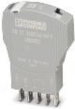
Electronic device circuit breaker, 1-pos., active current limitation, 1 N/O contact, plug for base element.

Please be informed that the data shown in this PDF Document is generated from our Online Catalog. Please find the complete data in the user's documentation. Our General Terms of Use for Downloads are valid ( http://phoenixcontact.com/download )